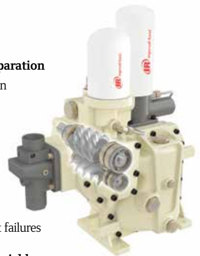
The all-in-one CE55X air end features improved air/oil separation and reliability.