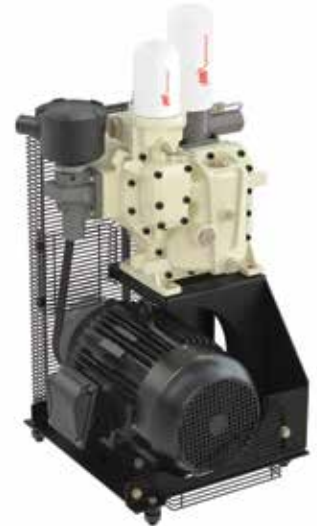
Vertically-stacked drive components reduce overall footprint by 20%.